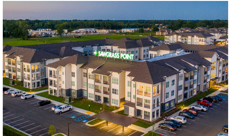
SAWGRASS POINT Gonzales, LA 272-unit Interior Corridor & Townhomes

"The Odeon is the latest addition to the South Market District, and the second project we have designed in the neighborhood. At 30 stories tall, it will be the tallest building constructed in New Orleans in over thirty years, and we're excited to have worked on such an iconic project just a few blocks away from our New Orleans studio."