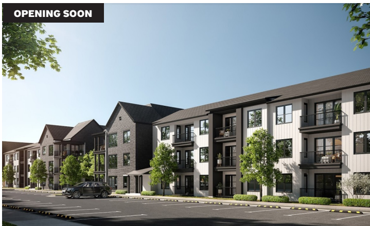
THE COLLINS AT RESEARCH PARK Huntsville, AL 284-unit 2-story Big House®/ 3-story e-Urban®

"It's been amazing to see the success of Sawgrass Point – with the addition of elevators, conditioned corridors, and the offering of both flats and townhomes, this project has elevated the standard of apartment living in this high-growth suburb of Baton Rouge and gotten the attention of investors looking into that market."