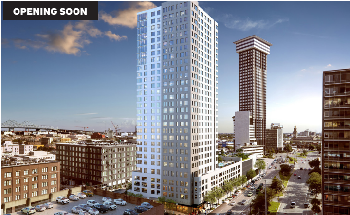
THE ODEON New Orleans 273-unit Mixed-Use High Rise

"The Odeon is the latest addition to the South Market District, and the second project we have designed in the neighborhood. At 30 stories tall, it will be the tallest building constructed in New Orleans in over thirty years, and we're excited to have worked on such an iconic project just a few blocks away from our New Orleans studio"